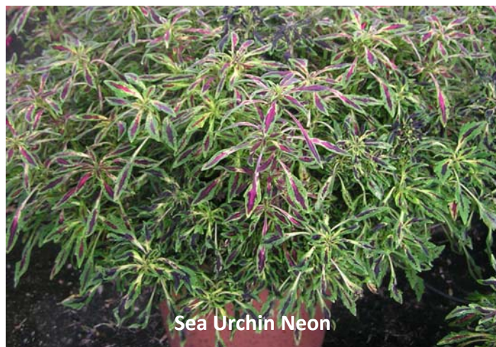
Sea Urchin Neon

New additions to the Under the Sea® series of coleus from Hort Couture have brightened our container trials in sun and part shade during the past season with different plant sizes, leaf shapes, and color combinations. Pink Reef, a favorite in our full sun trials, will be new for 2017. The Sea Monkey collection includes dwarf varieties with intricate leaf margins and are best suited for small containers. The Sea Urchin collection includes mop-head forms with narrower leaves than typical coleus. We noticed that Sea Urchin Copper (and Sea Urchin Red; not pictured) developed taller, flowering shoots later in summer, so may benefit from pruning to maintain the mop-head form.