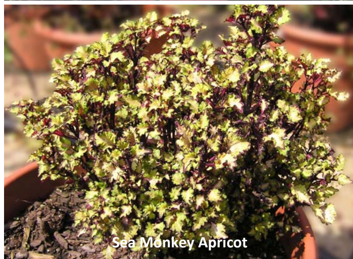
Sea Monkey Apricot