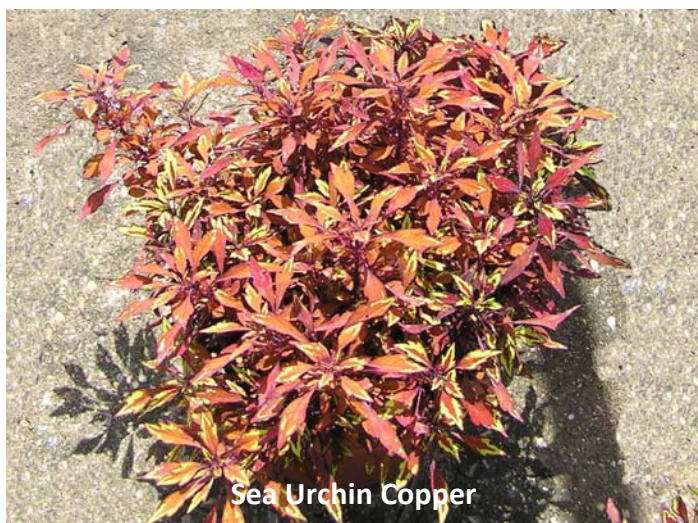
Sea Urchin Copper